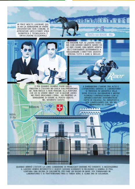
Fig. 1 – Examples of chromatic choices reflecting the internal articulation of the graphic novel.